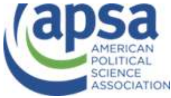
Exhibit Reservation Form

APSA 2024 Annual Meeting & Exhibition September 5th - 8th, 2024 Pennsylvania Convention Center Philadelphia, PA